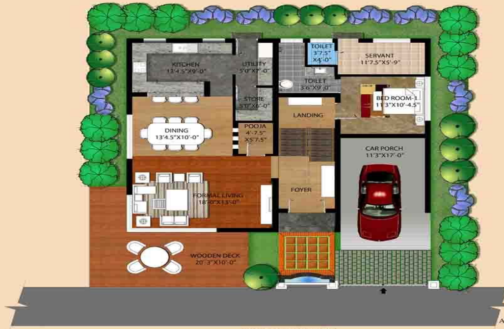
GROUND FLOOR PLAN (TYPE - 1)

PROPOSED LAYOUT PLAN FOR INDUS CITYSCAPES CONSTRUCTION (P) LTD.